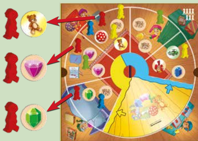
Example: Lea (red) retrieves her three kobolds from the game board, and selects one token from each section. She takes one teddy, one violet gem and one green gem. Then she rolls the die ...