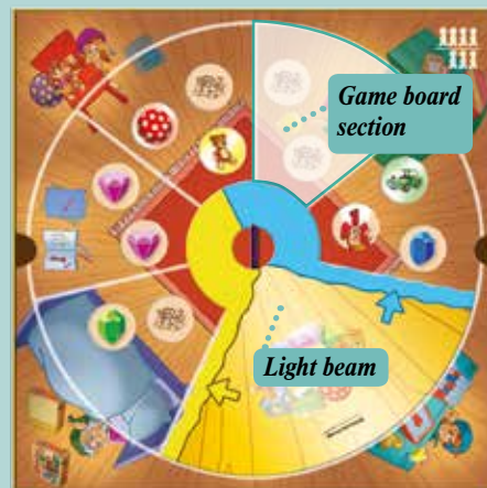
Game board section

= Place the token face down on the space