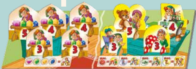
5 gem trophies & 4 toy trophies

Fix the trophies to their corresponding bases. Place the gem trophies on the left side of the trophy board, the toy trophies on the right side.